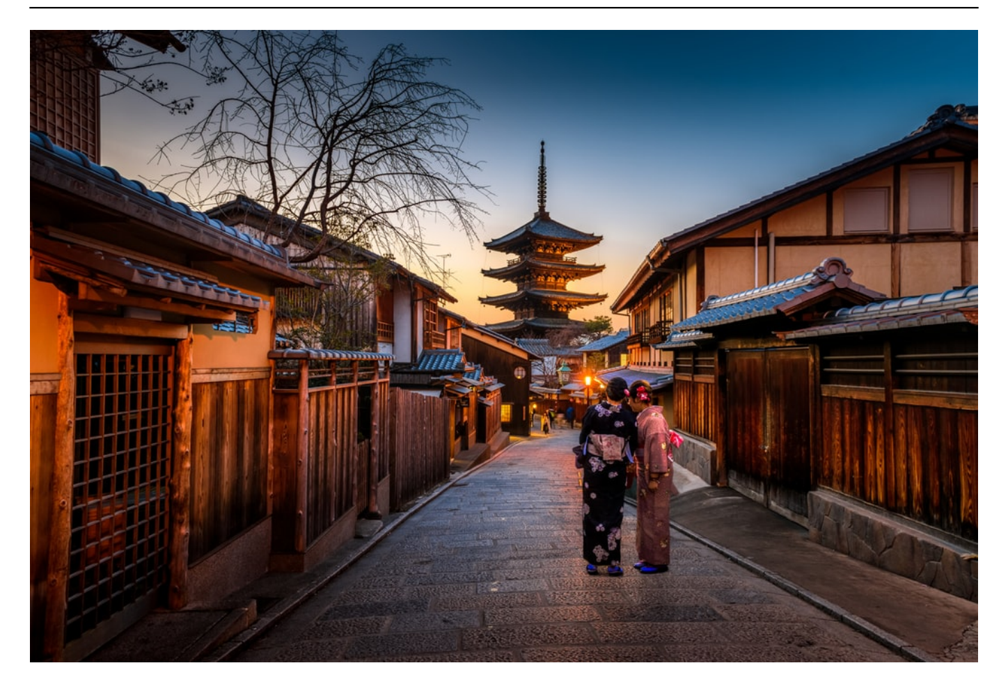
Figure 2. Old ways in new days

The VIP system is derived from profiling and is designed to safeguard the lives of those prisoners. If you throw these prisoners along with other inmates, you may open the cell in the morning and find them dead. How do you explain that?... the prison is not meant to punish people, the punishment ends with the judge"s pronouncement, thereafter correction begins. (Daily Trust 2015, 21)