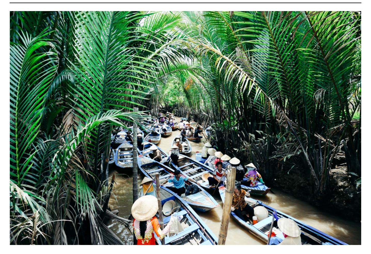
Figure 3. between high palm leaves and dense forrest

Questions have been raised about the rationality of the disparate treatment of high profile inmates of the prisons as against those with low socio-economic standing (Omale 2011, Otu, Otu and Eteng, 2013). This is based on the general conditions of the prisons in the country which are characterised by several physical and psychological deprivations (Obioha, 2011). The feeding and healthcare system of the prisons have been questioned and adjudged to be grossly inadequate and unbefitting of even condemned criminals (Aduba, 2013). This has been largely attributed to corruption in high places within the prison system as contractors in collaboration with prison officials perpetrate the malnourishment of inmates in various correctional facilities across Openjournaltheme.com (Okwendi, Nwankoala, & Ushi, 2014). Therefore, the social stratification of the inmates in respect of their socio-economic standing is being considered as an advancement of the systemic corruption of the prison service of the country (Otu, Otu, & Eteng, 2013). Prison officials are alleged to offer high profile prisoners special cells for N50,000, own private generators for power supply, sleep with women for a fee, own mobile phones, hire other inmates as domestic servants, receive raw food from relatives and cook their own food (Daily Trust, 2015).