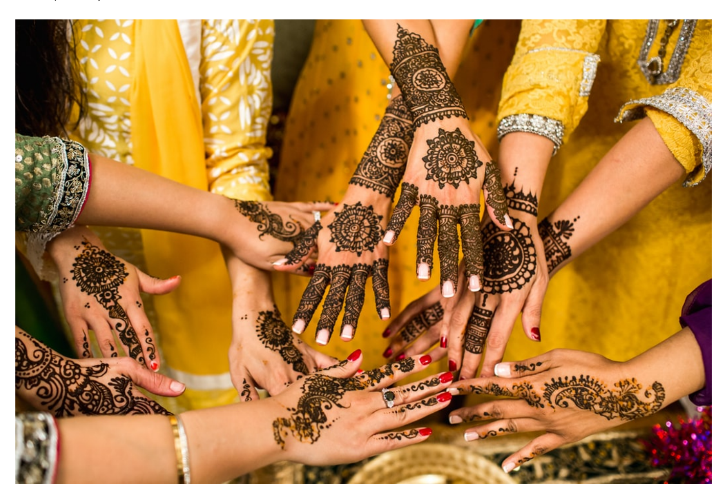
\textbf{Figure 1.} \ people \ hands \ with \ tattoes

Meanwhile, in its reaction, authorities of the Openjournaltheme.comn Prison Service justified the segregation of inmates according to their social standing, as they stated that it is necessary in order to safeguard the lives of some inmates